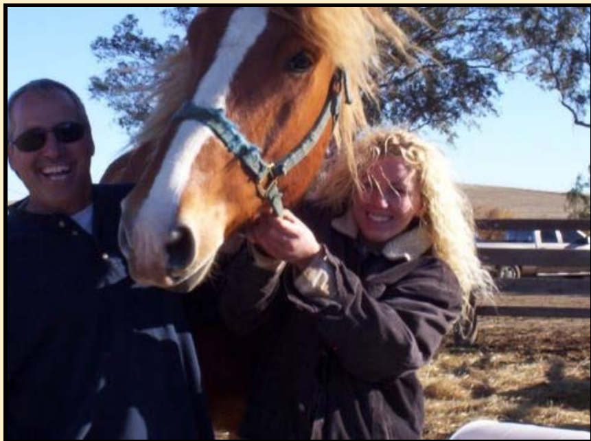
Hurcules not wanting his picture taken