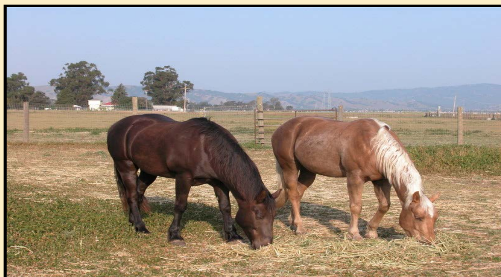
Tanner and Buddy enjoying some good Rye