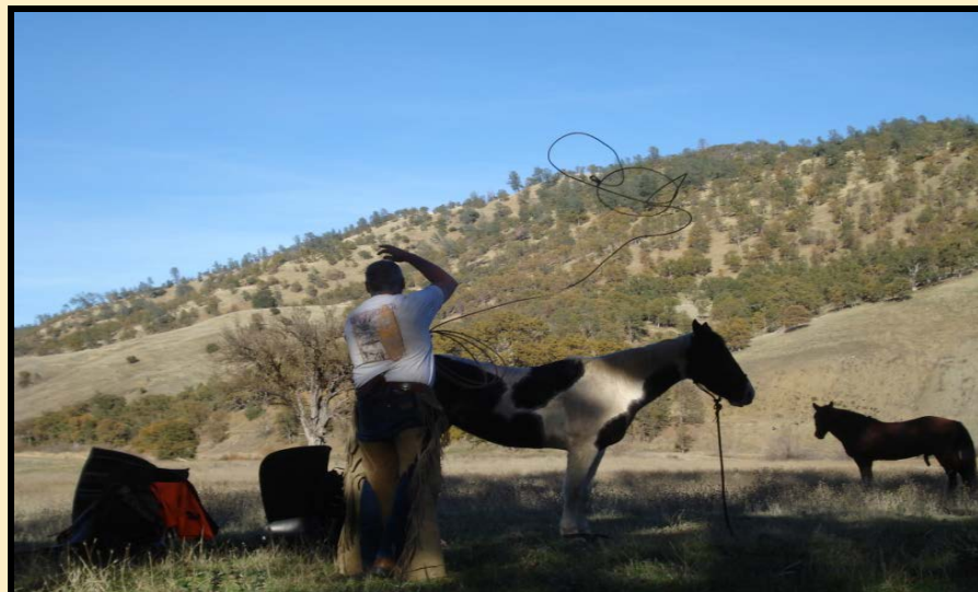
Getting some sacking out done while the horses rest for lunch