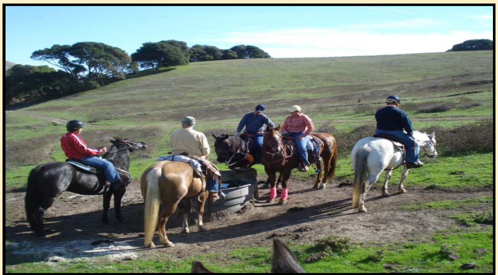
Trial ride at Lynch Canyon meeting at the watering hole