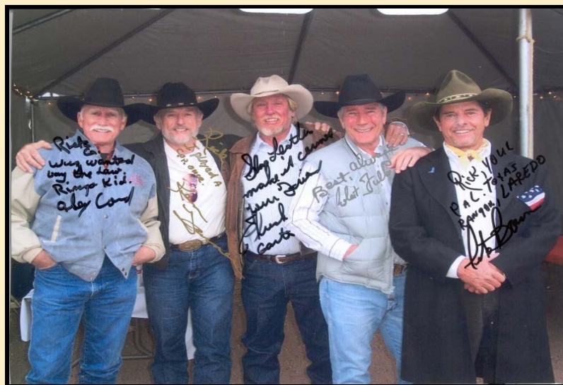
Above: Old TV Cowboys signed a picture for me.