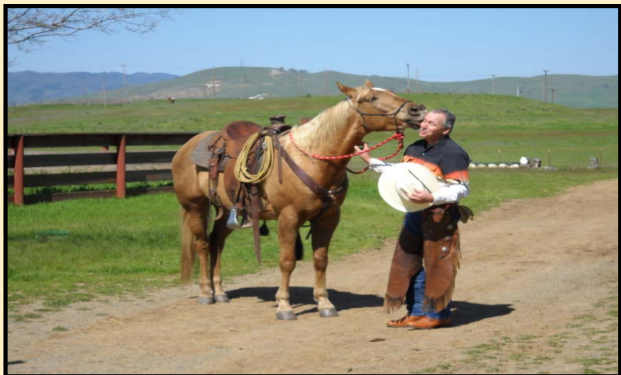
Buddy giving me a sloppy kiss.